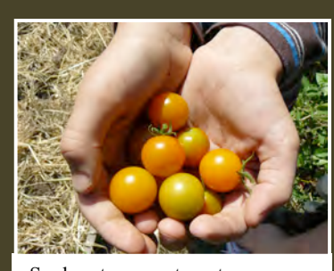
Sunburst orange tomatoes are one of the students' favorite snacks to find in the garden.