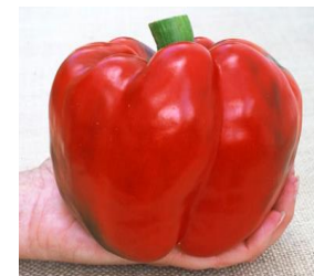
X3R Red Knight

Hungarian Hot Wax Yellow, hot, long peppers. Thick-fleshed for frying. El Jefe Jalapeno Medium heat. Early, long, jalapeno. High yield.