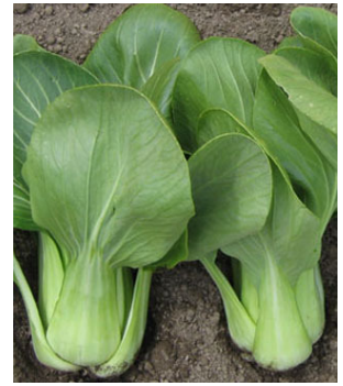
Mei Qing Choi