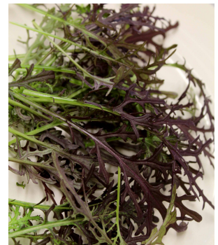
Scarlet Frill Mustard Green