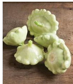
Bennings Green Tint

Zephyr: Yellow & pale green. Very long & very beautiful.