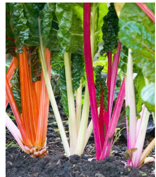
Bright Lights Swiss Chard