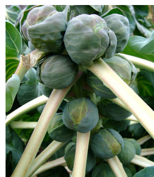
Gustus Brussel Sprouts