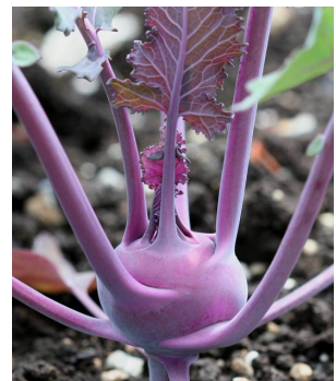
Kolibri Purple Kohlrabi