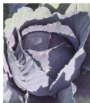
Super Red 80 Cabbage