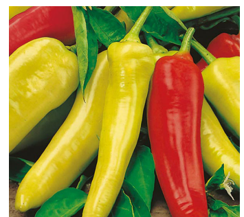
Hungarian Hot Wax Pepper